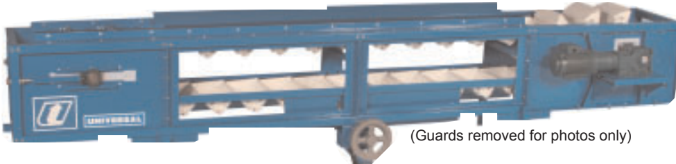
(Guards removed for photos only)